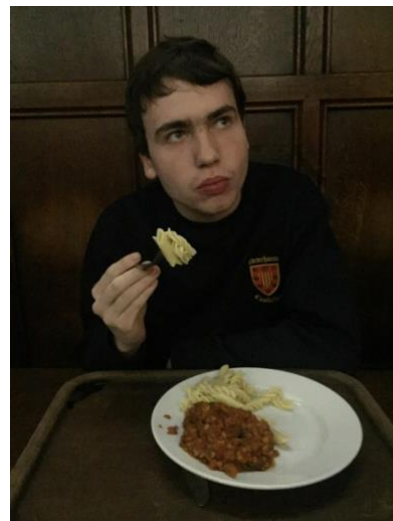
Thinking about improving Bar and Buttery policy