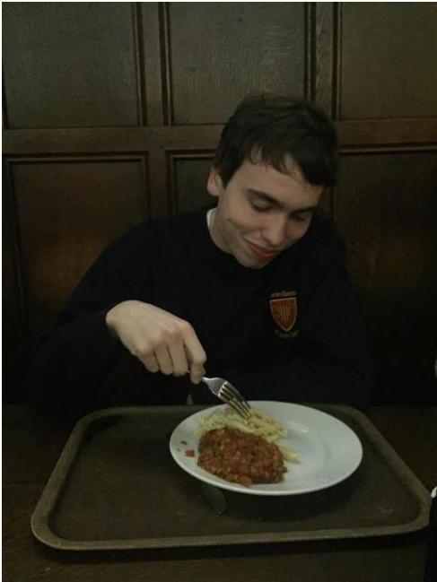
Tucking in to a nice meal